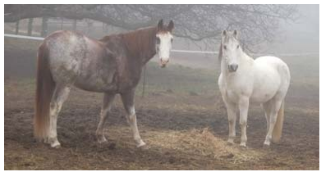
Redman & Contendor

His name conjures up images of strength, virility and leadership. The first time I saw him I felt his strong masculine presence and was awed by his beauty. I also recall feeling somewhat afraid of him - as if all that strength and energy posed a threat to me of some sort. In spite of that, there was an irresistible attraction - an inner knowing that Contendor had much to teach me.