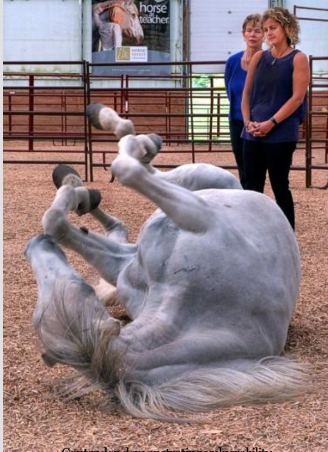
Contendor demonstrating vulnerability.

gift of Love! Love for others and most importantly for myself. They brought me back home to myself, healing my heart in the process. Horses are spiritual beings connecting with people from a place of pure heartedness.